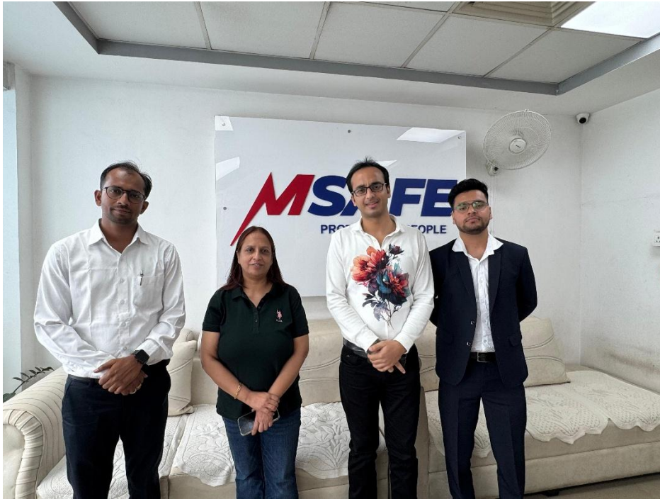
Sales and Marketing office - Ground floor, C-108, Sector 2, Noida, Uttar Pradesh-201301